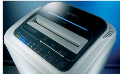
Touch Screen Panel

Just touch the controls to activate the machine functions. Keep your finger on the "Forward" control for 5 seconds and the machine functions continuously for 30 seconds when transparent material needs to be shredded. A visual signal notifies the operator when the blades should be lubricated for improved cutting capacity.