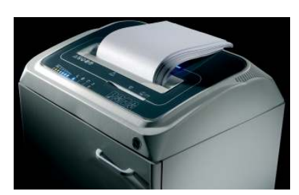
High shredding capacity Shreds up to 32* sheets of paper at a time. "AUTOMATIC REVERSE" System in case of iamming.