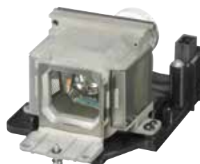
LMP-E212 Projector Lamp (for replacement)