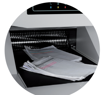
Electric Conveyor Belt

Removable steel trolley with a special interchangeable bin for one 470 lt bag or two 235 lt waste bags