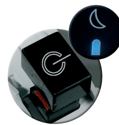
AUTOMATIC DISCONNECTION FROM THE MAINS No longer any need to switch off the shredder before leaving the office. Maximum power saving