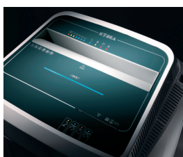
TOUCH SCREEN PANEL

AUTOMATIC REVERSE automatic reverse in case of jamming