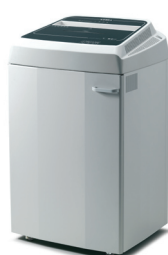
205 LITERS CABINET Sturdy and large volume steel cabinet

Just touch the controls to activate the machine functions. Keep your finger on the "Forward" control for 5 seconds and the machine functions continuously for 30 seconds when transparent material needs to be shredded. A light comes on when the blades need to be oiled