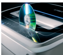
TWO ENTRY OPENINGS AND TWO SETS OF CUTTING KNIVES for the separate insertion and shredding of paper, CDs, DVDs and credit cards and separation of shredded material. Optional CD / DVD Cutting Unit