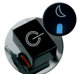
AUTOMATIC DISCONNECTION FROM THE MAINS

for the separate insertion and shredding of paper, CDs, DVDs and credit cards and separation of shredded material. Optional CD / DVD Cutting Unit