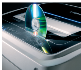
TWO ENTRY OPENINGS TWO SETS OF CUTTING KNIVES

Sturdy and large volume 205 liters steel cabinet equipped with a built-in automatic oiling system which eliminates the need for manual oiling of cutting knives