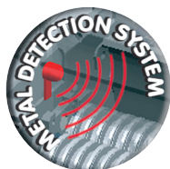
METAL DETECTOR - MD

Stops the machine when large metal objects, which could cause a damage to the cutting knives, are accidentally inserted. An illuminated optical indicator warns the operator to remove these objects in order to protect the knives.